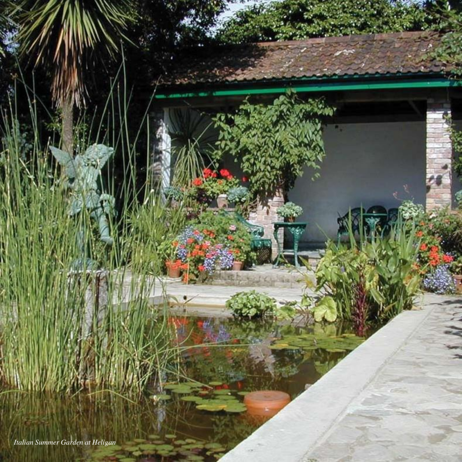
Italian Summer Garden at Heligan