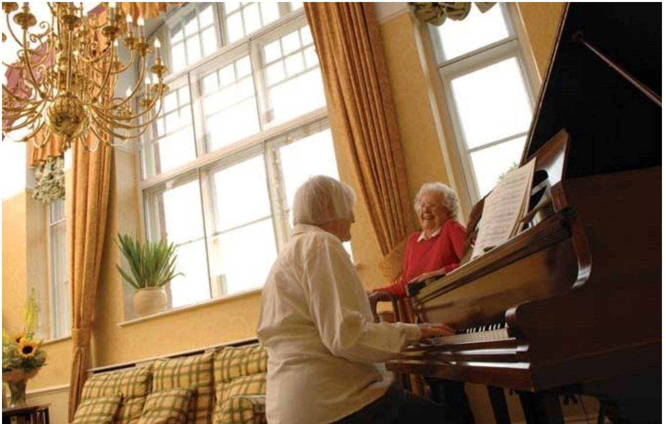
Enjoying life at the grand piano in one of the two lounges.